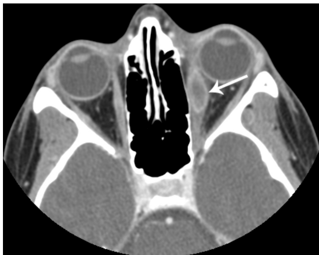
Figure 2 Patient 3. Axial contrast-enhanced orbital CT demonstrates marked swelling of the left medial rectus muscle with a more focal peripherally enhancing mass in the mid-muscle belly (white arrow). There is mild induration of the left retrobulbar fat with slight proptosis.

treatment. Patients with orbital cellulitis usually have high fever and a prompt response to antibiotic therapy. However, they can also have eyelid erythema, ptosis and impaired motor function of one or more extraocular muscles, similar to OM. 3 The differential diagnosis of paediatric OM also includes rhabdomyosarcoma, thyroid eye disease, leukaemia, sarcoidosis, vasculitis, tuberculosis, histiocytosis, ruptured dermoid cyst, arteriovenous malformations and paranasal sinus mucocoele. 7–15